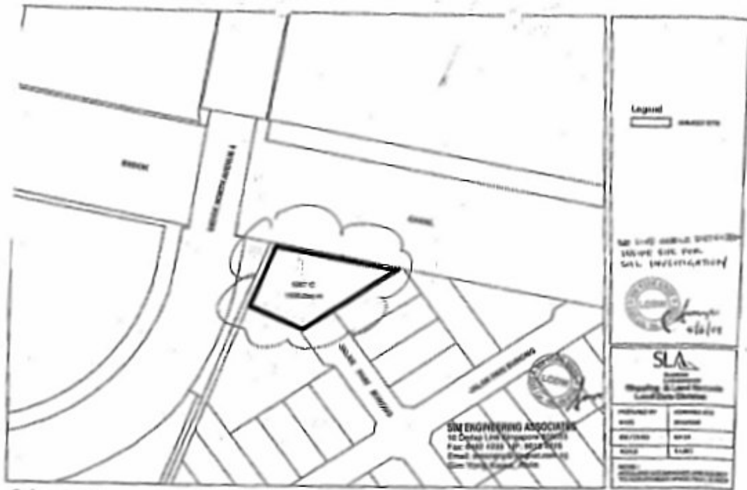
Jalan Pui Hwang / Bedok North Ave 4 Lot 1267 C MK 28 .