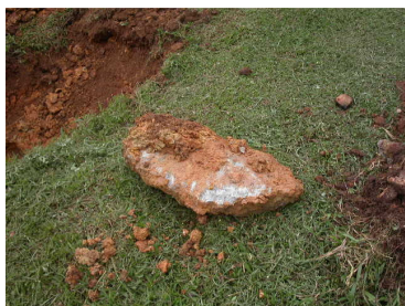
Trace of broken concrete found in this trial pit