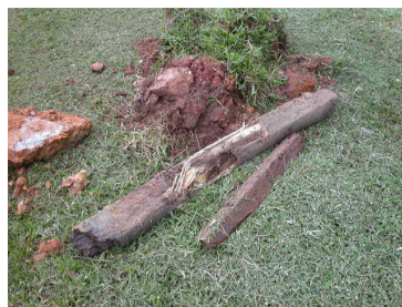
Trace of large wood planks found in this trial pit