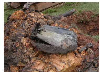
Trace of large wood block found in this trial pit

Location: Land Parcel No. 4 at Jalan Insaf